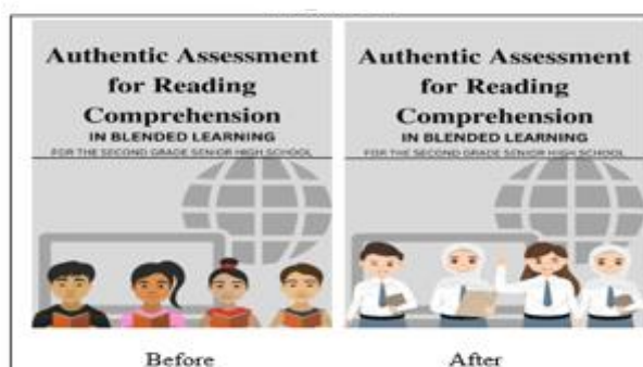
Fig 1 Authentic Assessment

The information on expert reviews comes in the same forms, including expert recommendations for enhancing authentic assessment of reading comprehension based on expert evaluations. During the expert's review, the validators recommend improvements to the design and several other things. The validators suggest replacing the cover image with a more polite image and adjusting to real conditions, to make the text a bit shorter, because the story text is too long, to make a story based on the culture in around of students, achievement indicators for the subject matter be made more complete to measure student abilities, to add pictures that can guide students' interest and curiosity, and also provide a part of difficult vocabularies.